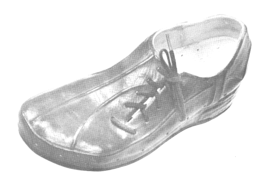
MURRAY SPACE SHOE®